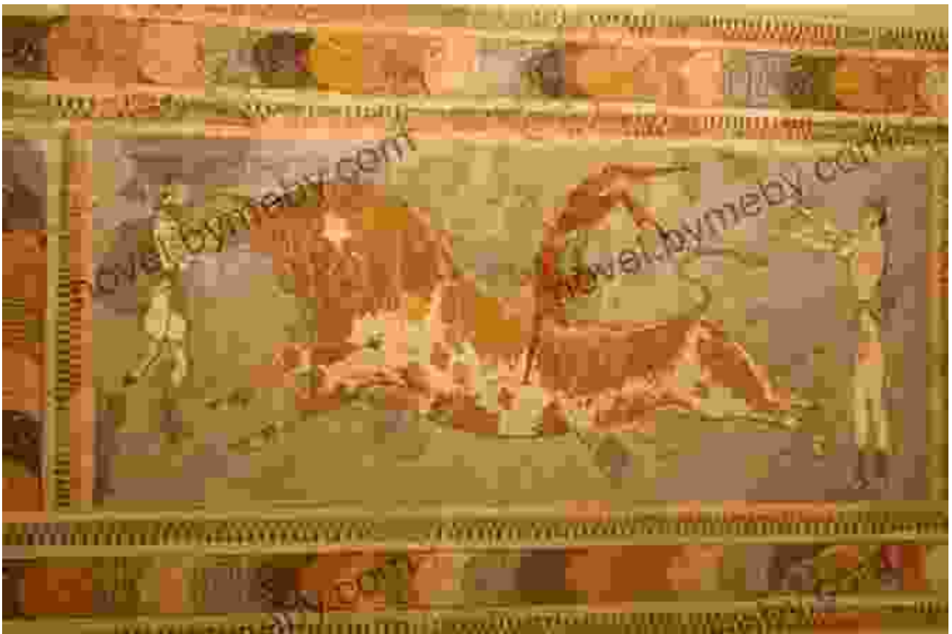
Minoan fresco depicting a bull-leaping ceremony