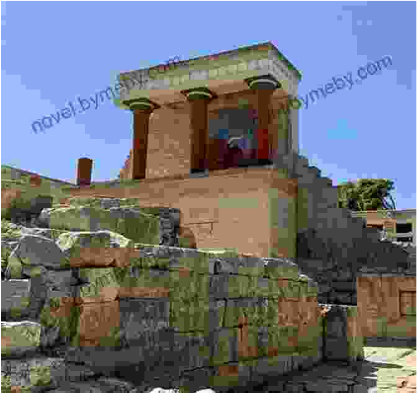
Knossos palace complex on the island of Crete