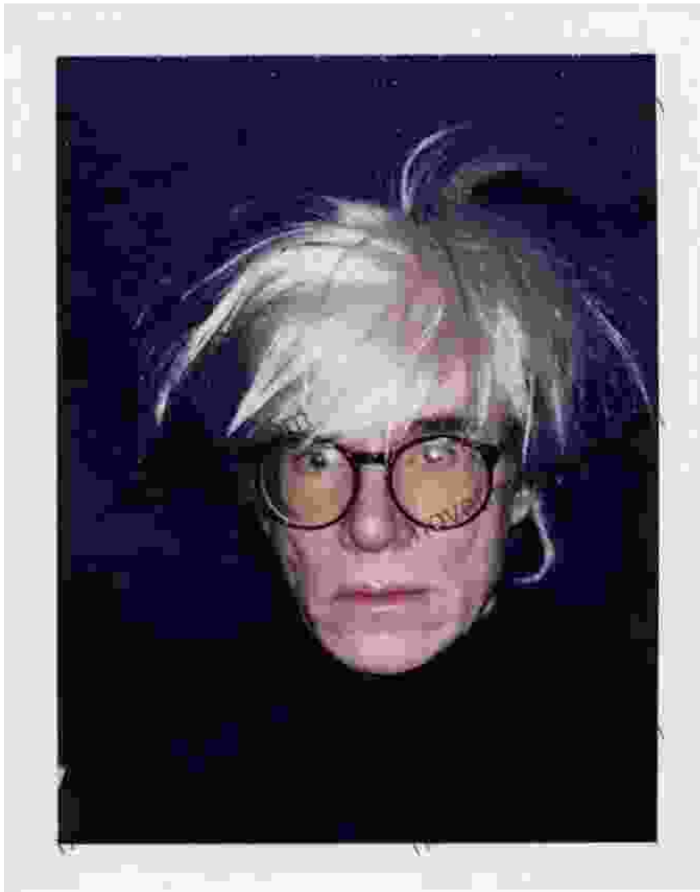
Pablo Picasso: Timeless Elegance

Andy Warhol, the father of Pop Art, embraced a minimalist and uniform style that mirrored his artistic aesthetic. His iconic silver wigs, black turtlenecks, and jeans became instantly recognizable, embodying the coolness and detachment of the Pop Art movement. Warhol's wardrobe choices not only reflected his artistic philosophy but also his desire to maintain anonymity and focus on his work.