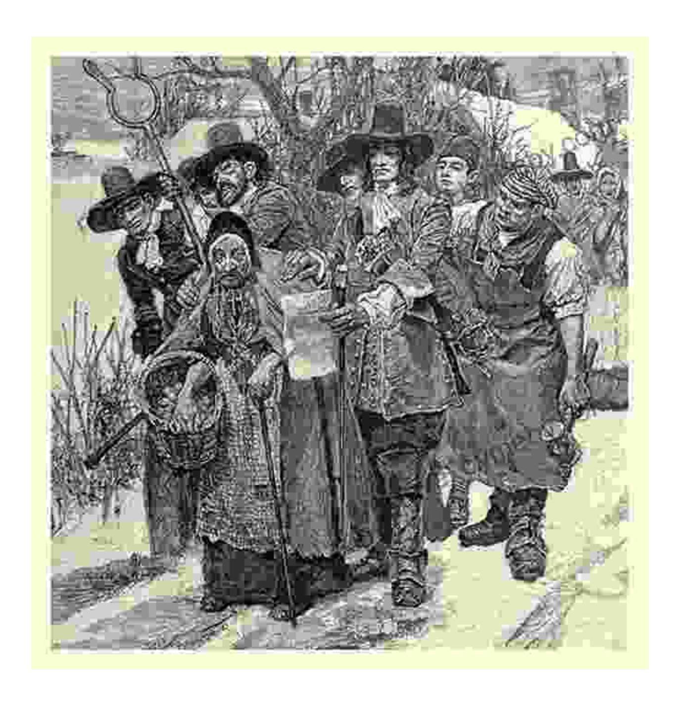
Embrace the Enchanting Legacy of "The Witches of Avalon"

"The Witches of Avalon" is a literary odyssey that will captivate readers of all ages. Whether you are a seasoned fantasy enthusiast or a newcomer to the genre, this masterpiece will transport you to a world that is both magical and profoundly moving. Its timeless themes and captivating storytelling will leave a lasting impression on your imagination.